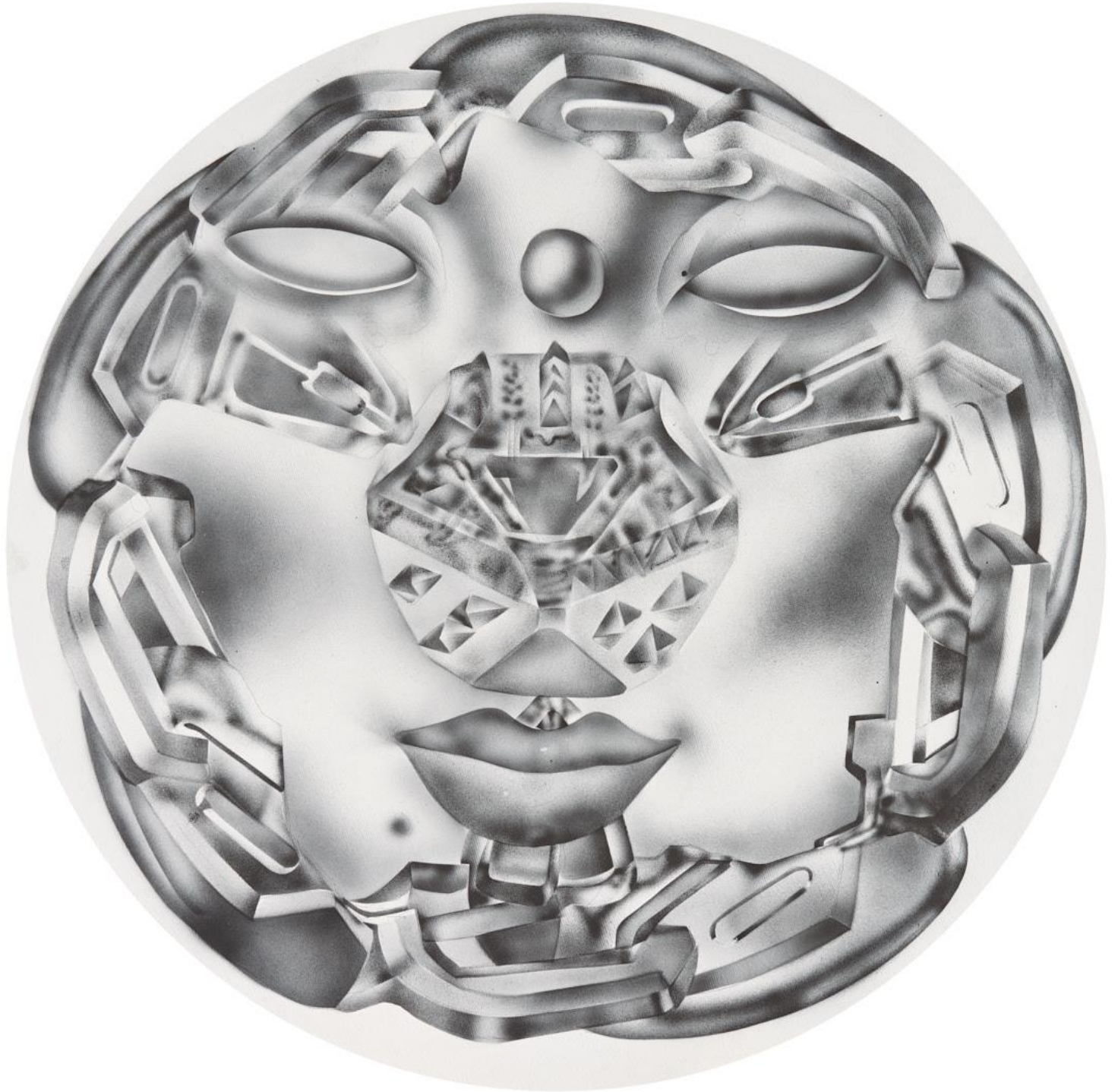
Slices of Time II. airbrush on canvas r: 60 cm