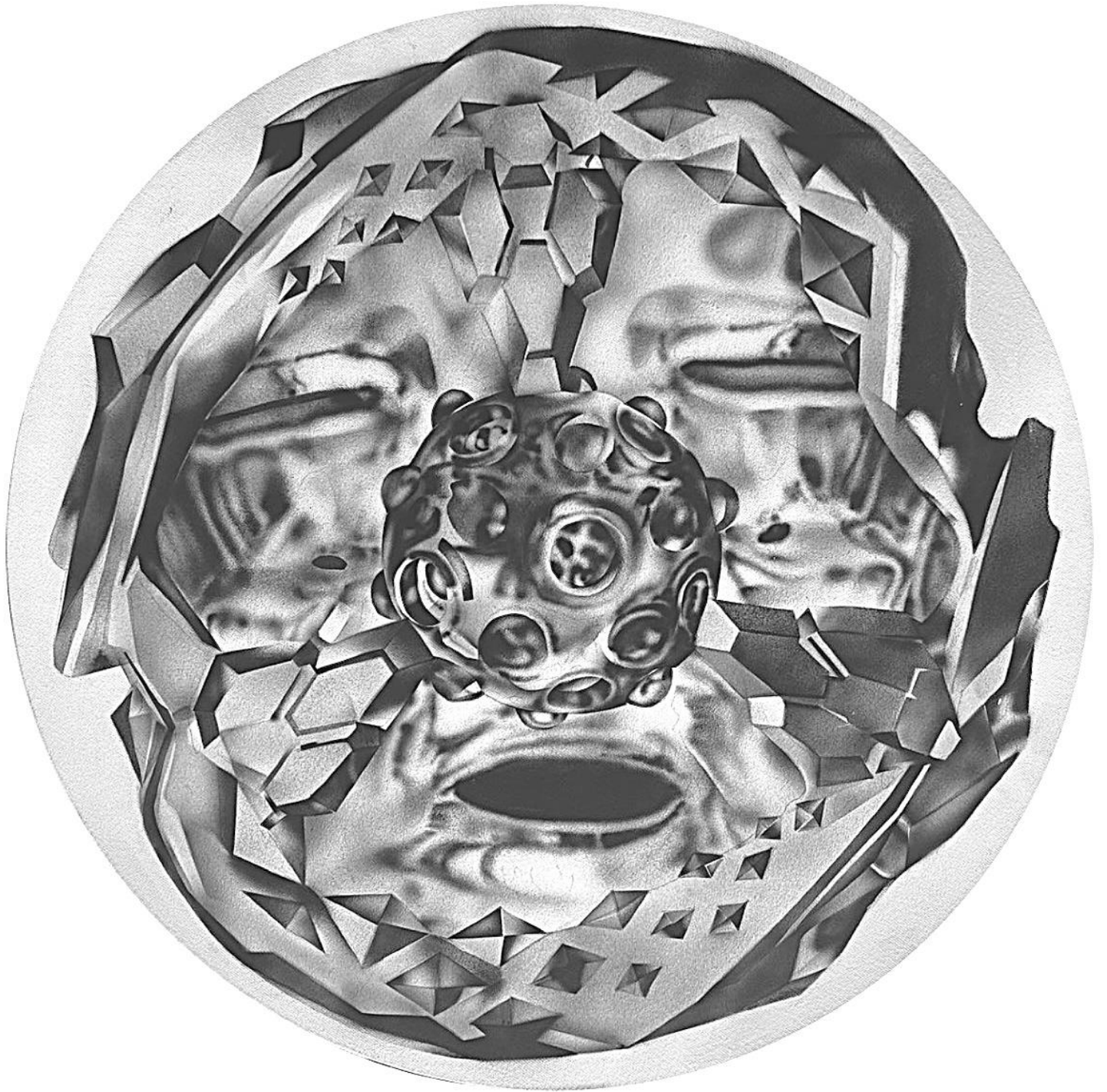
Slices of Time II. airbrush on canvas r: 60 cm