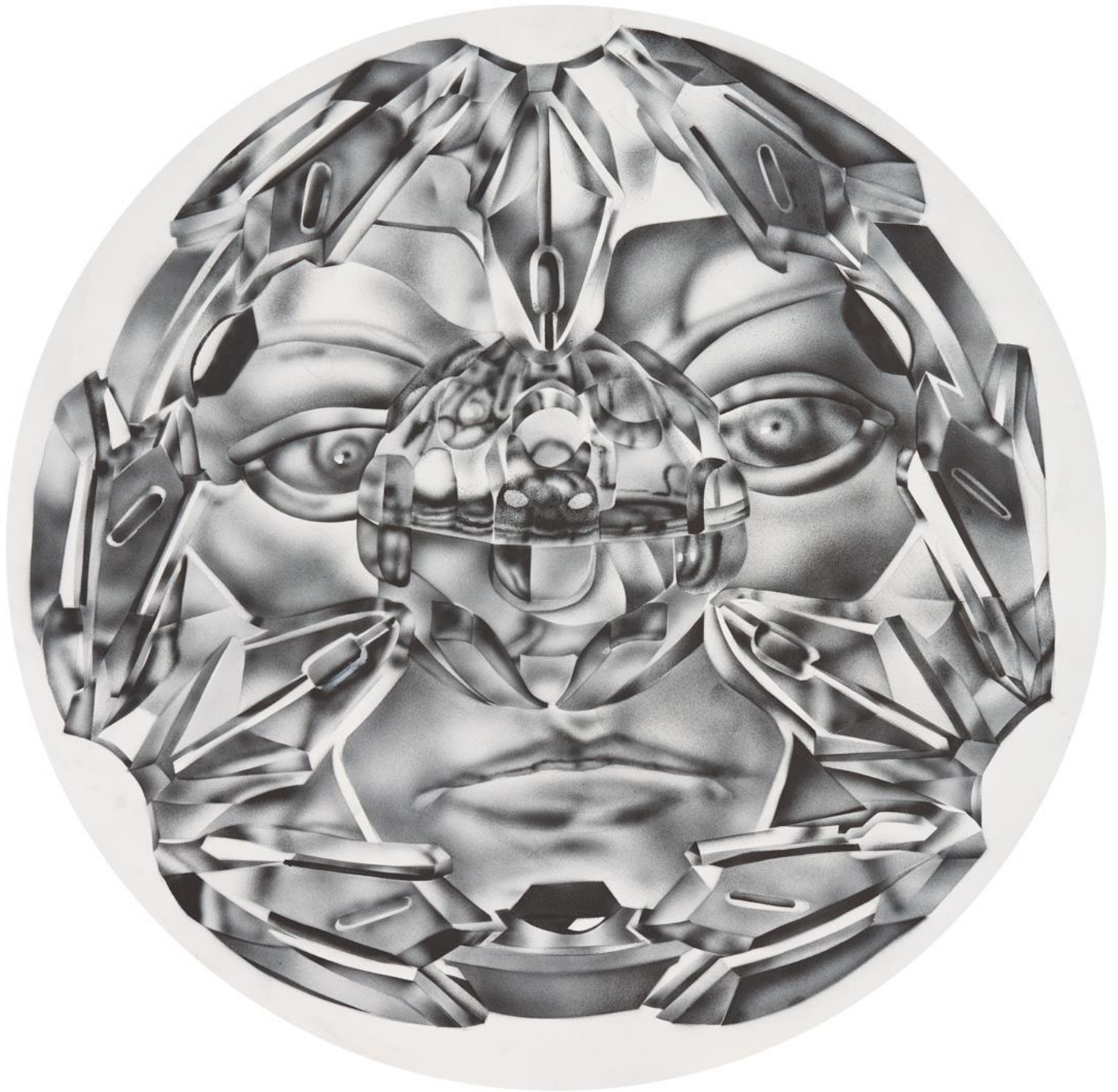
Slices of Time I. airbrush on canvas r: 60 cm