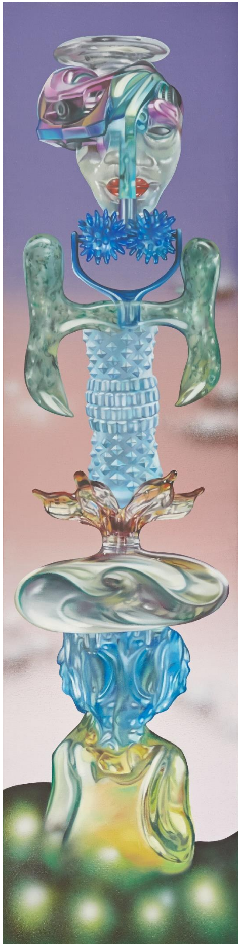
Longtermhandstand @ LISTE Art Fair Basel 2024