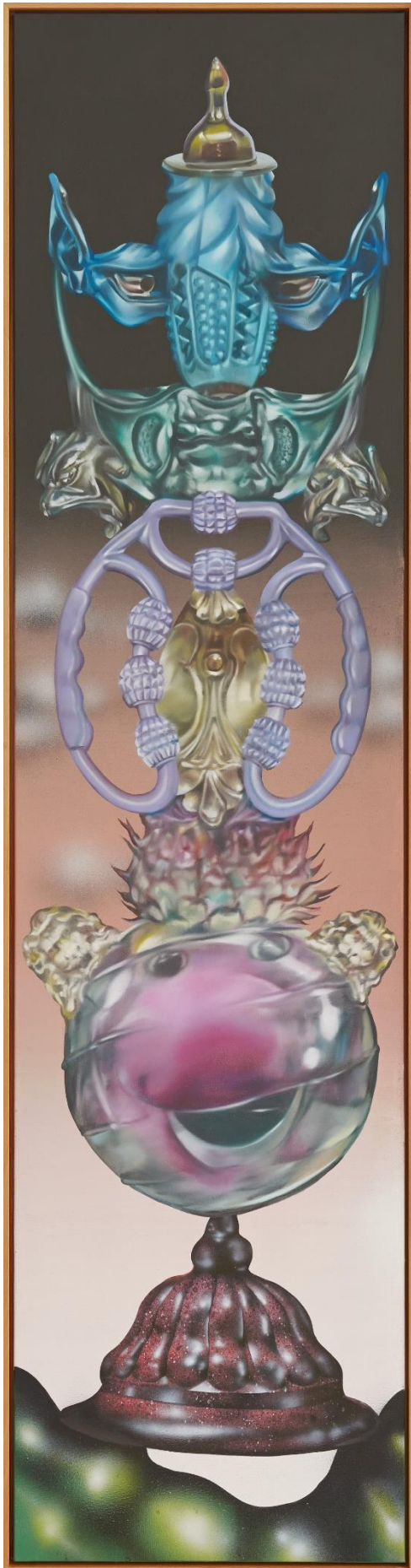
Understanding 2024 Oil acrylic on canvas artist frame 200x50 cm