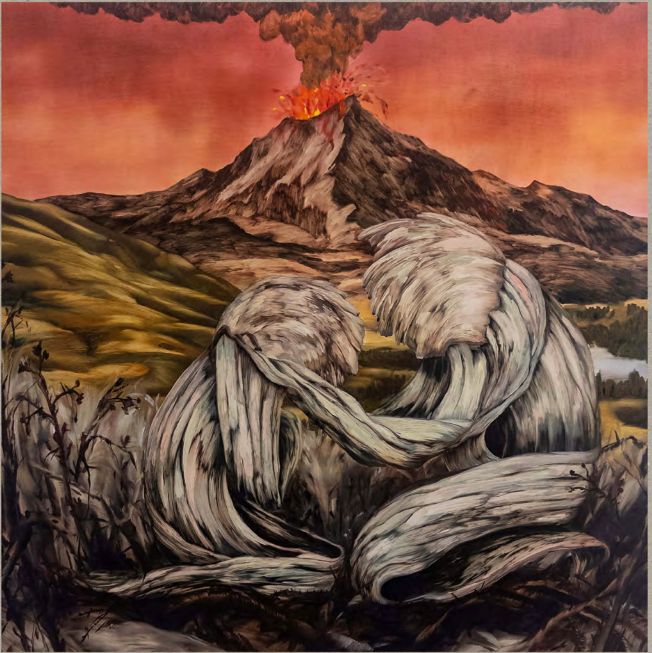
Mónica Kárándi Maybe we can breathe 2025 100 x 100 cm Oil, acrylic on canvas