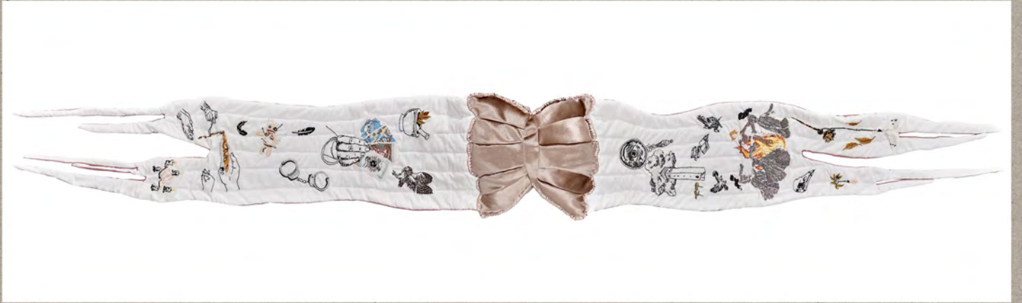
Mónika Kárándi Witch house 2025 110 x 27 x 10 cm Textile, hand embroidery