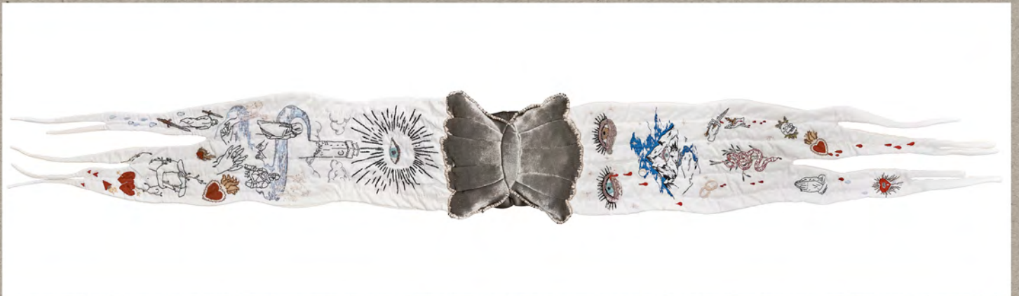
Mónika Kárándi Seeking eyes 2025 110 x 27 x 10 cm Textile, hand embroidery