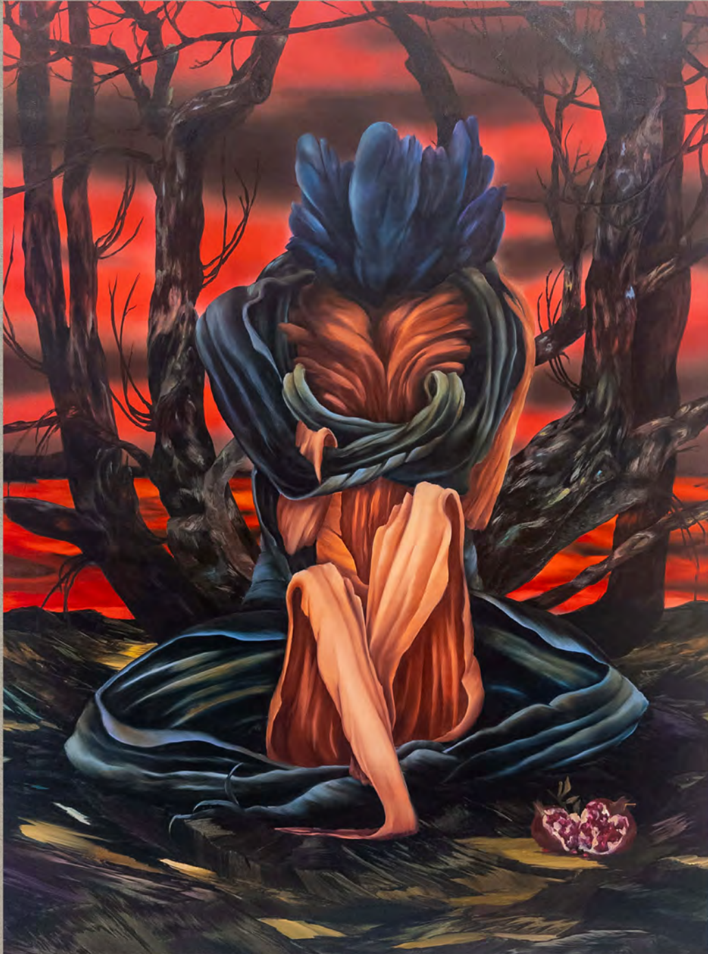
Mónica Kárándi Can we breathe? 2026 135 x 100 cm Oil, acrylic on canvas