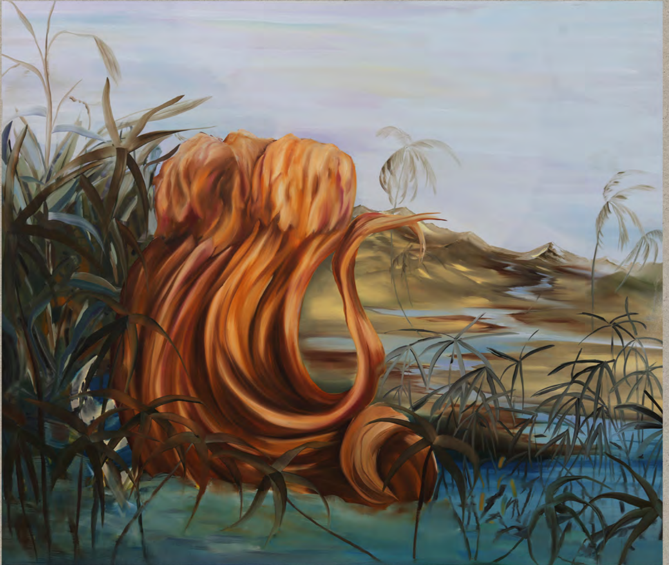
Mónika Kárándi Listen to the wind blow 2023 120 x 140 cm Oil, acrylic on canvas