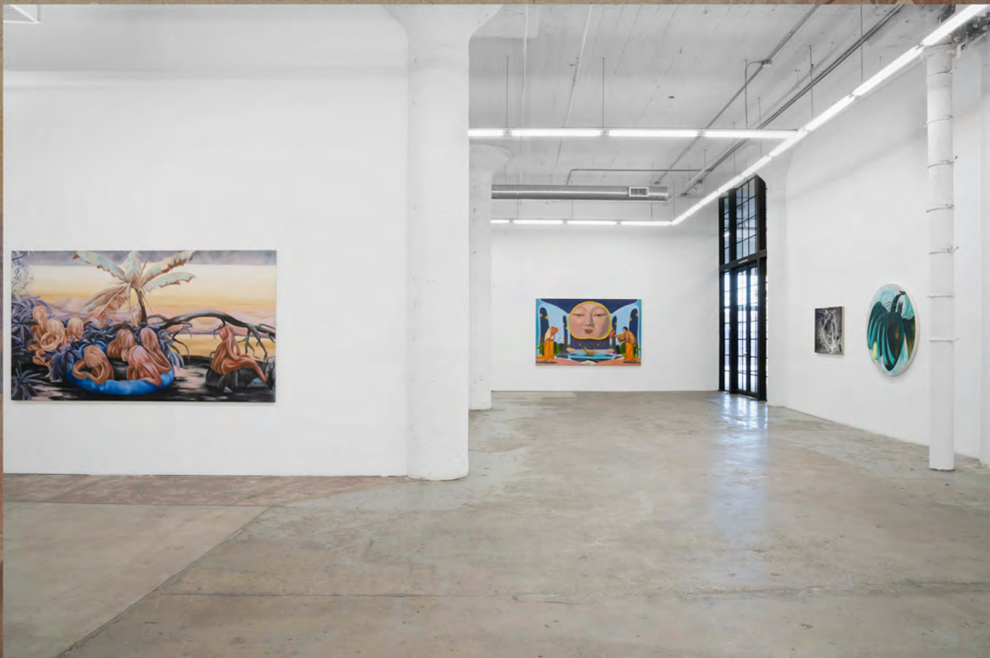
YOU ME ME YOU, 2022, Nicodim, Los Angeles, Installation view