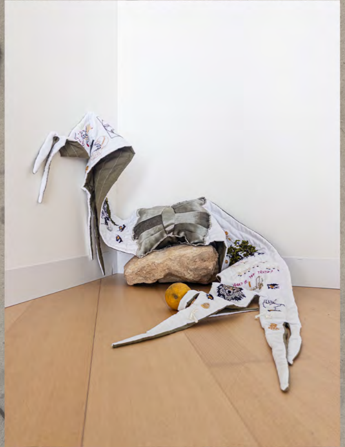
Installation view of Longtermhandstand's booth at ART COLOGNE MALLORCA 2026 featuring Mónica Kárándi