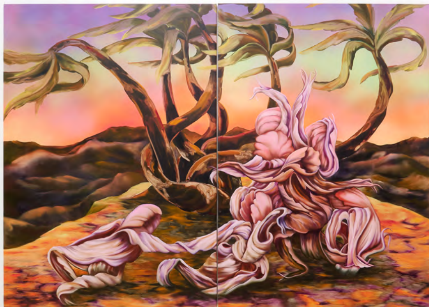
Mónica Kárándi Breaking hearts again 2023 200 x 280 cm Oil, acrylic on canvas