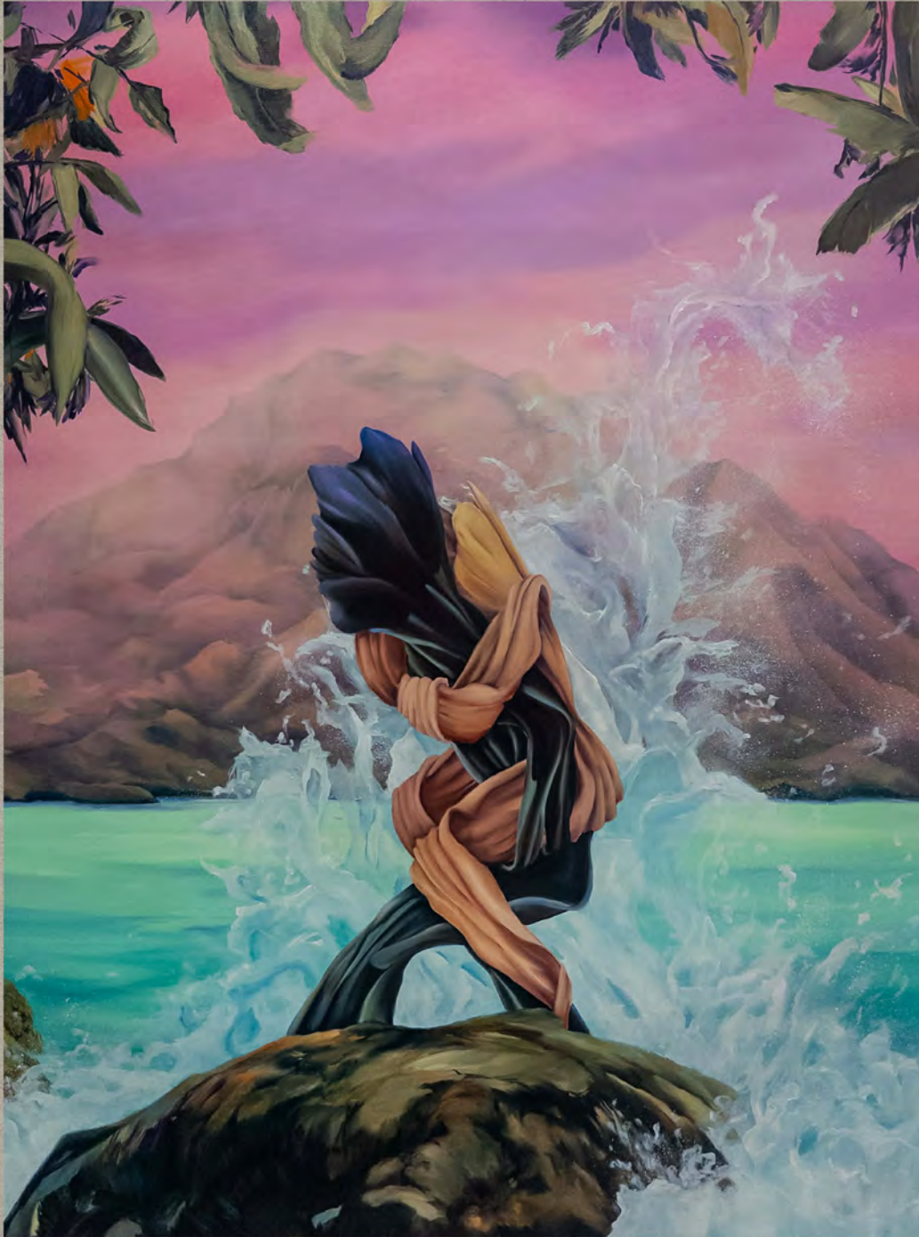
Mónica Kárándi We can breathe 2026 135 x 100 cm Oil, acrylic on canvas