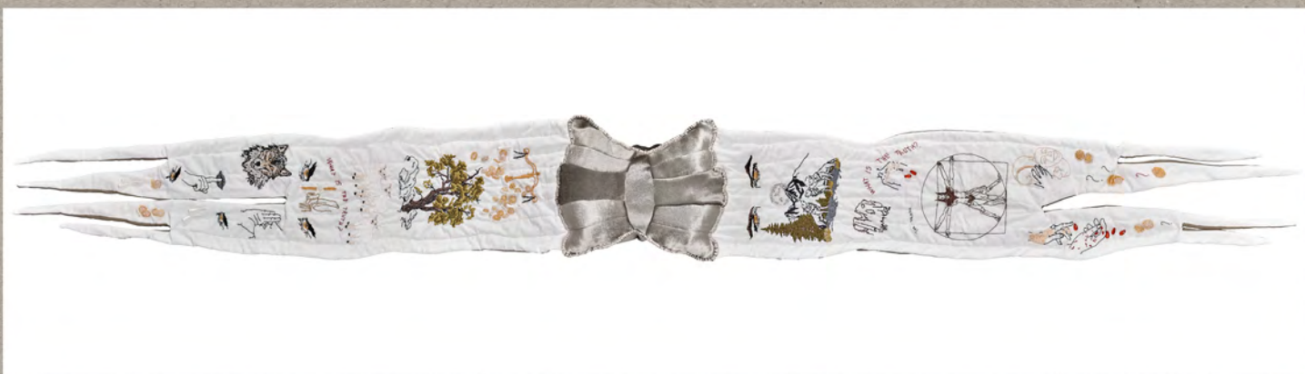
Mónika Kárándi Wolf cub 2026 110 x 27 x 10 cm Textile, hand embroidery