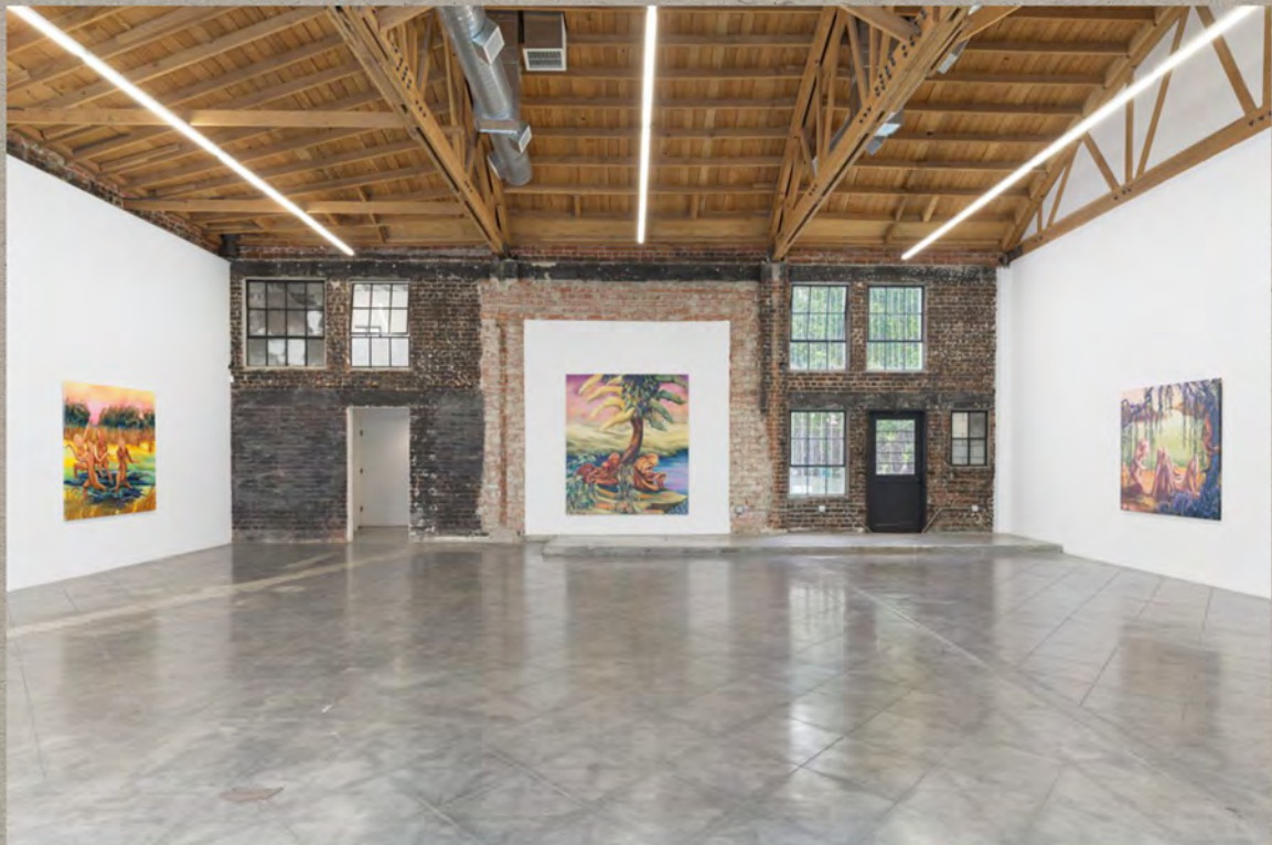
Mónica Kárándi Remember where we started out , 2023, Anat Ebgi Installation view