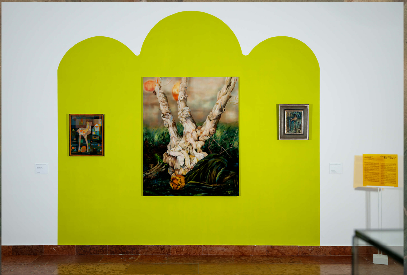
Intertwined , 2025, Hungarian National Gallery, Budapest, Installation view