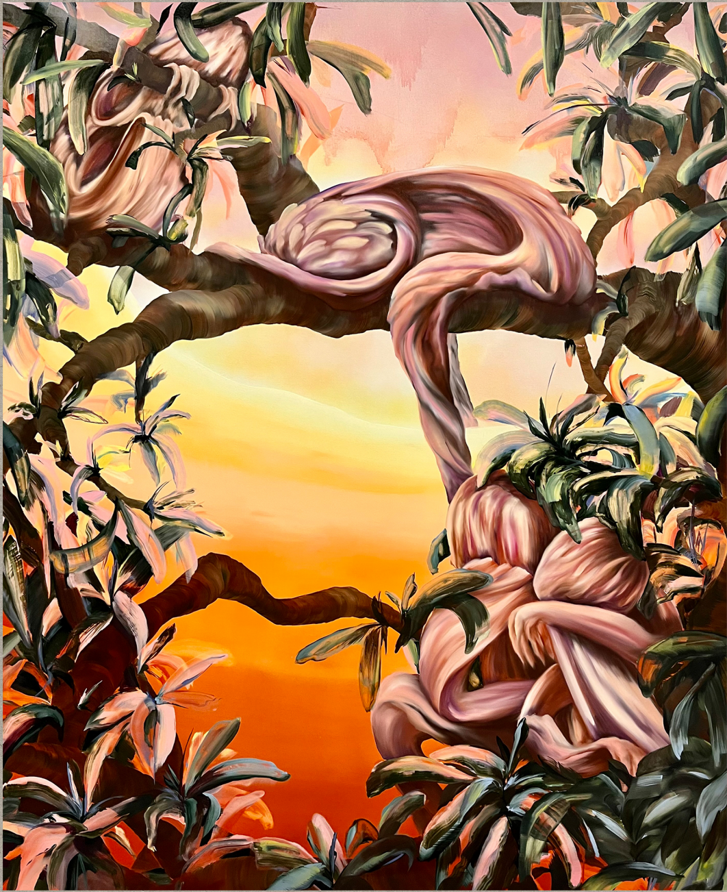
Mónica Kárándi I've heard a whisper 2023 200 x 170 cm Oil, acrylic on canvas