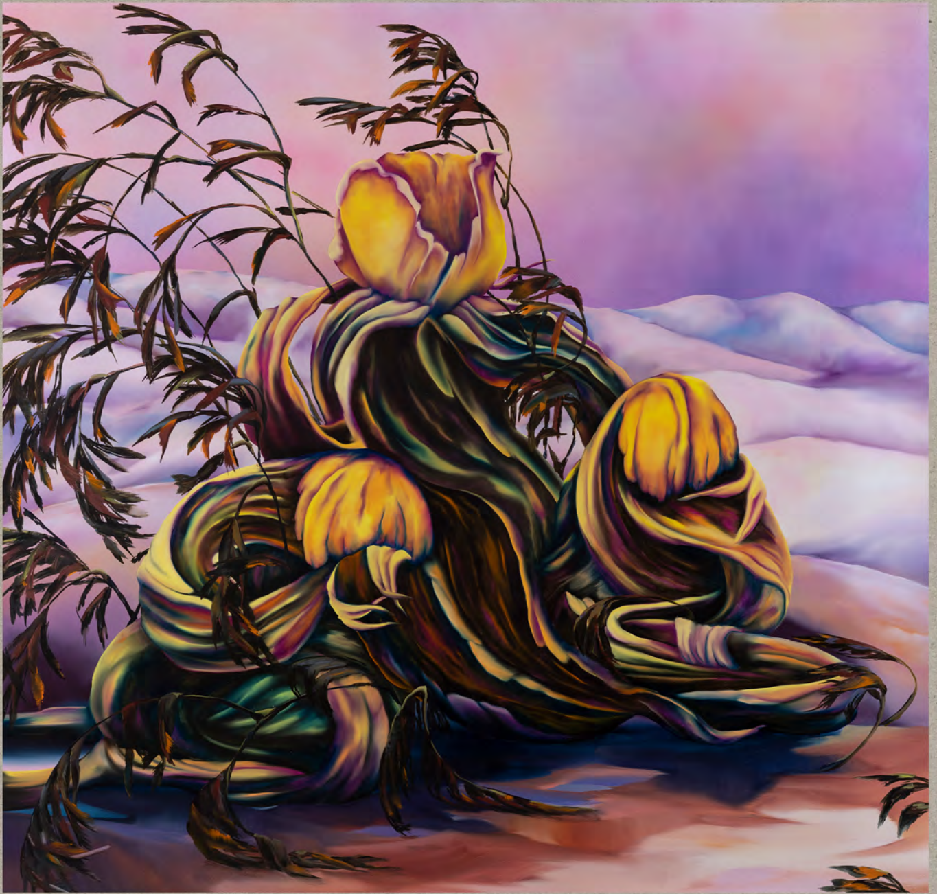
Mónika Kárándi Disturb the sound of silence 2023 150 x 145 cm Oil, acrylic on canvas