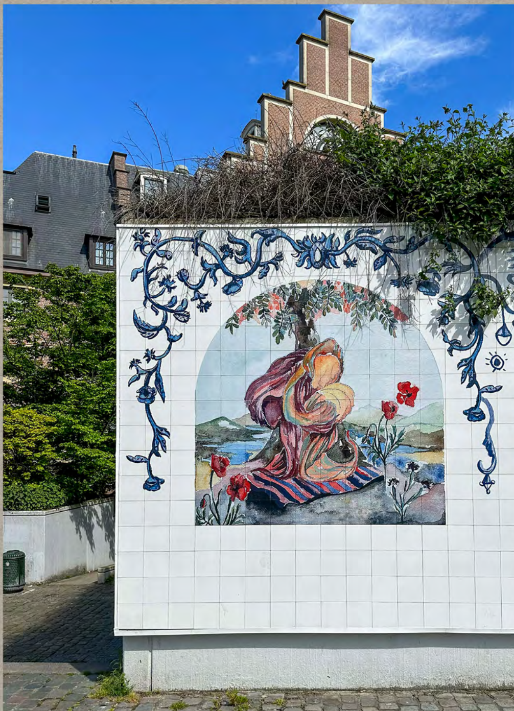
Flora Mural (ceramic triptych) by Mónika Kárándi at Place d'Espagne, Brussels